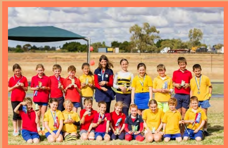
Age Champions and Runners Up